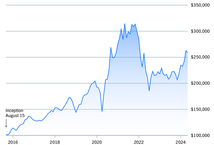
● Australasian Growth 2 Fund

If you had invested $100,000 at inception, the graph below shows what it would be worth today.